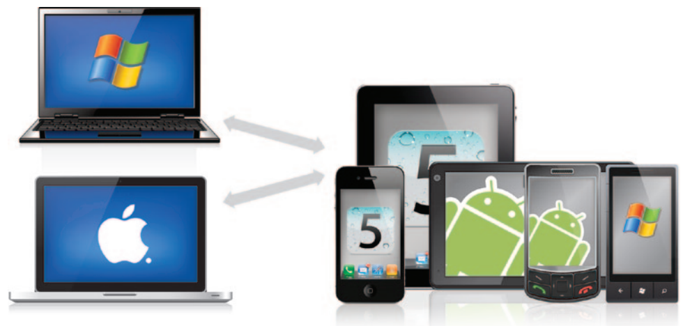
Fig 1 – IT administrators can manage devices from a Mac or a PC

With Absolute Manage MDM, all of your IT administrators can be mobile device experts. This is because Absolute Manage technology is designed to work within a Windows or Mac infrastructure. This allows administrators to use a Mac or a PC to manage all devices for a single, consolidated skill set across the team.